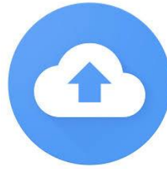
Backup & Sync